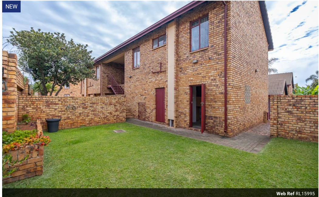
Web Ref RL15995

Loft Office 6 The Woodmill Lifestyle Centre Vredenburg Road Devonvallei Stellenbosch 7600