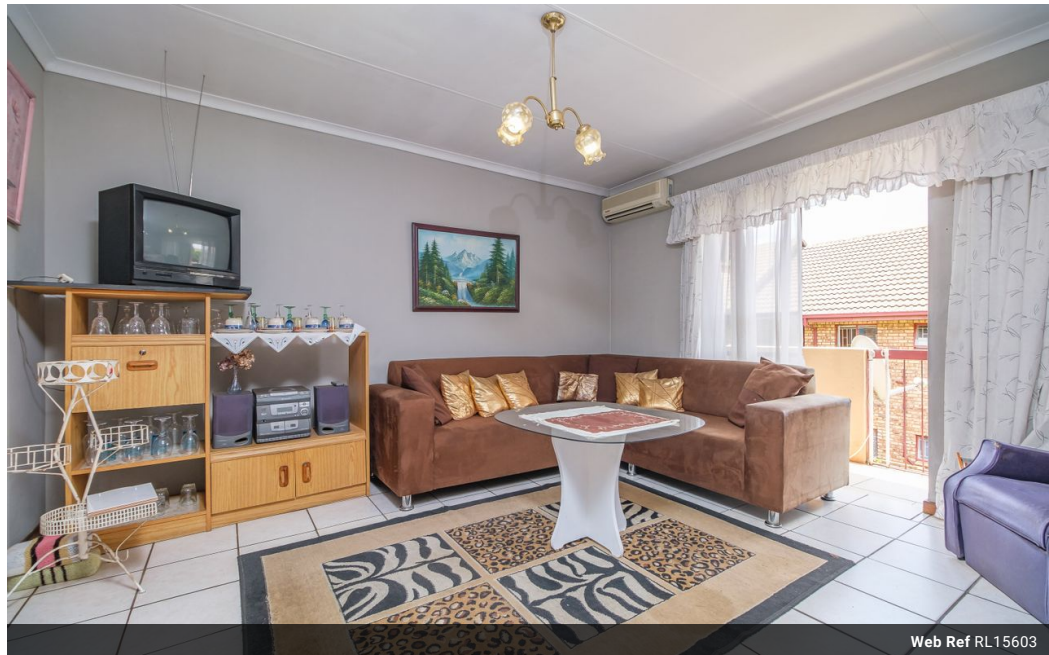
Web Ref RL15603

Loft Office 6 The Woodmill Lifestyle Centre Vredenburg Road Devonvallei Stellenbosch 7600