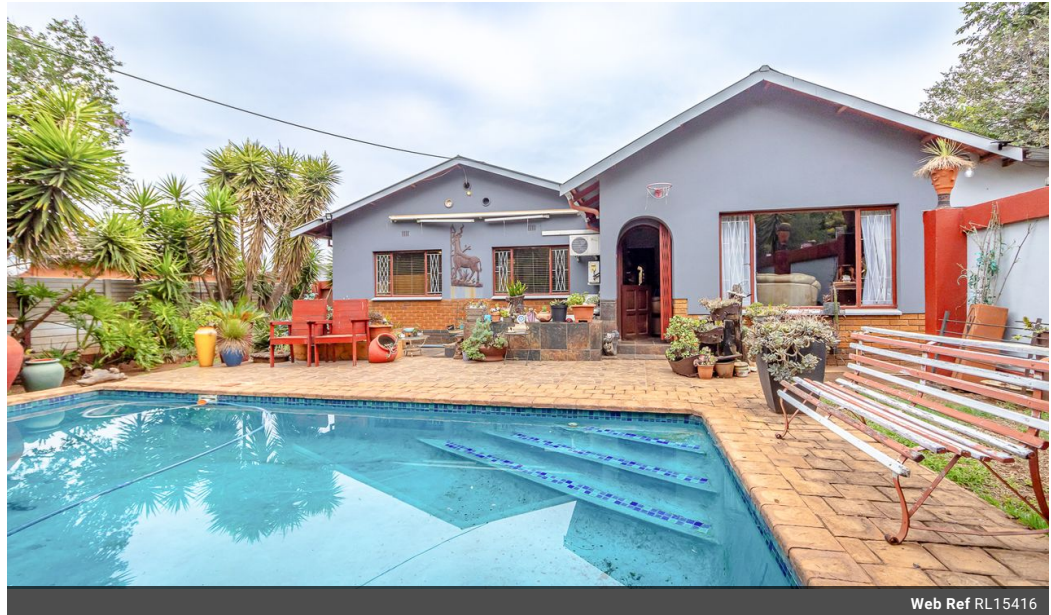
Web Ref RL15416

Loft Office 6 The Woodmill Lifestyle Centre Vredenburg Road Devonvallei Stellenbosch 7600