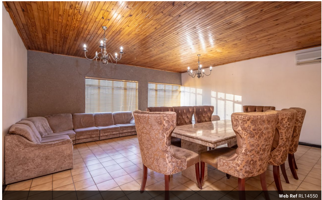
Web Ref RL14550

Loft Office 6 The Woodmill Lifestyle Centre Vredenburg Road Devonvallei Stellenbosch 7600