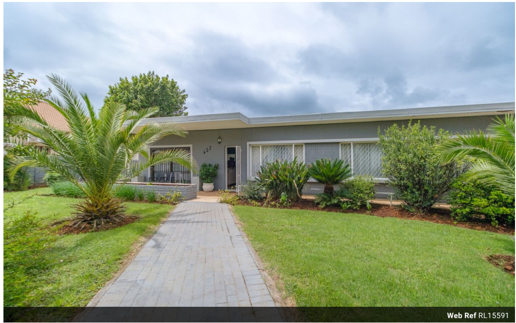
Web Ref RL15591

Loft Office 6 The Woodmill Lifestyle Centre Vredenburg Road Devonvallei Stellenbosch 7600