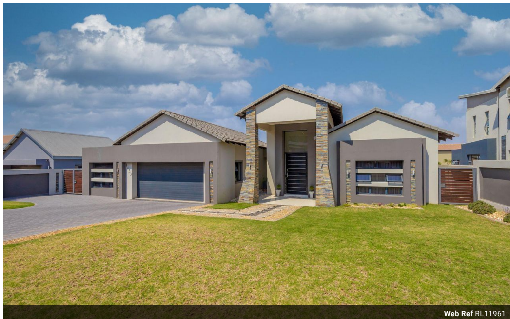
Web Ref RL11961

Loft Office 6 The Woodmill Lifestyle Centre Vredenburg Road Devonvallei Stellenbosch 7600