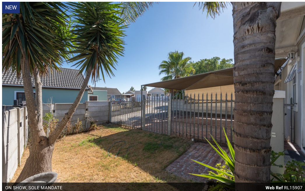
ON SHOW, SOLE MANDATE