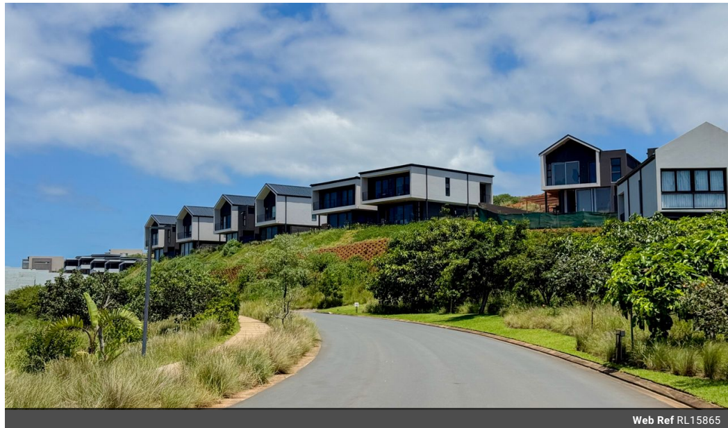
Web Ref RL15865

Loft Office 6 The Woodmill Lifestyle Centre Vredenburg Road Devonvallei Stellenbosch 7600