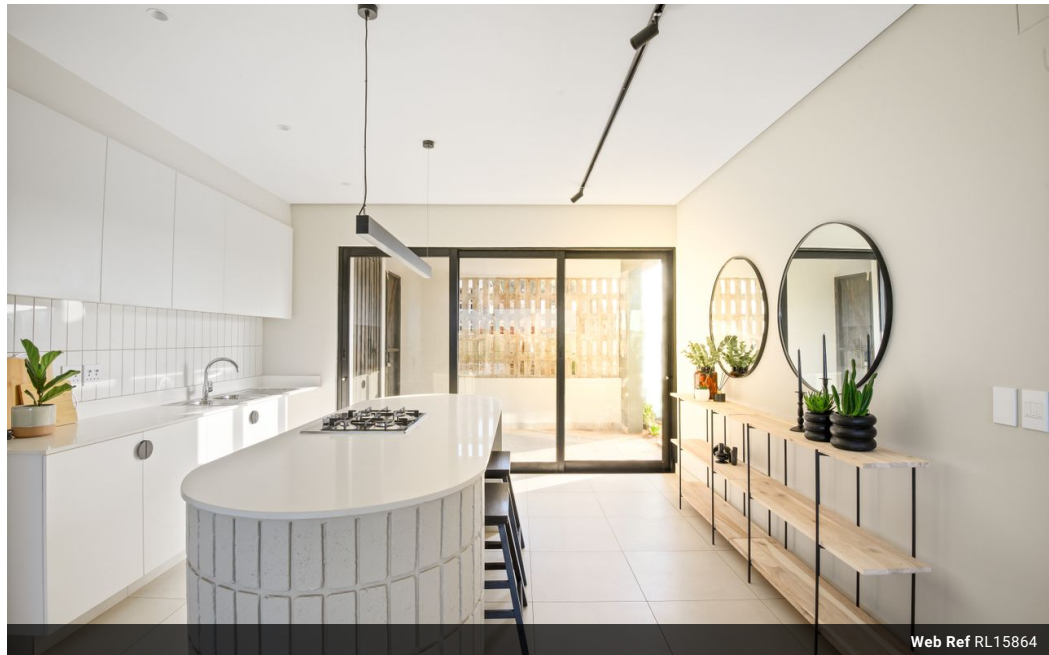
Web Ref RL15864

Loft Office 6 The Woodmill Lifestyle Centre Vredenburg Road Devonvallei Stellenbosch 7600