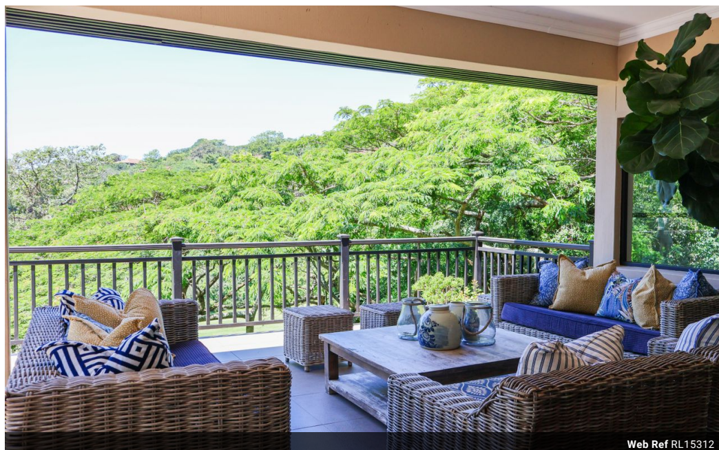
Web Ref RL15312

Loft Office 6 The Woodmill Lifestyle Centre Vredenburg Road Devonvallei Stellenbosch 7600