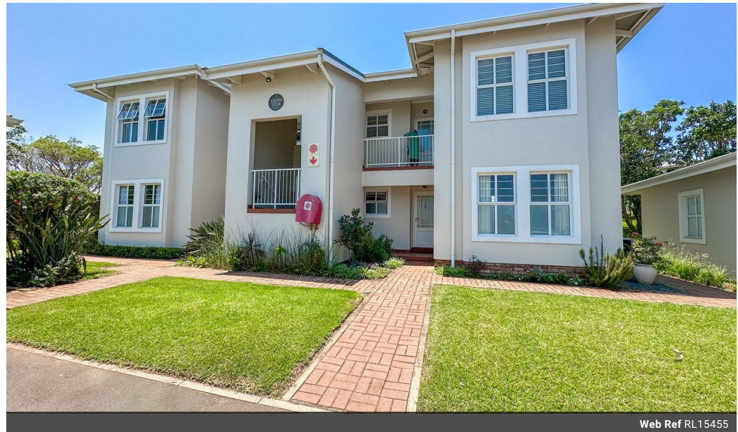
Web Ref RL15455

Loft Office 6 The Woodmill Lifestyle Centre Vredenburg Road Devonvallei Stellenbosch 7600