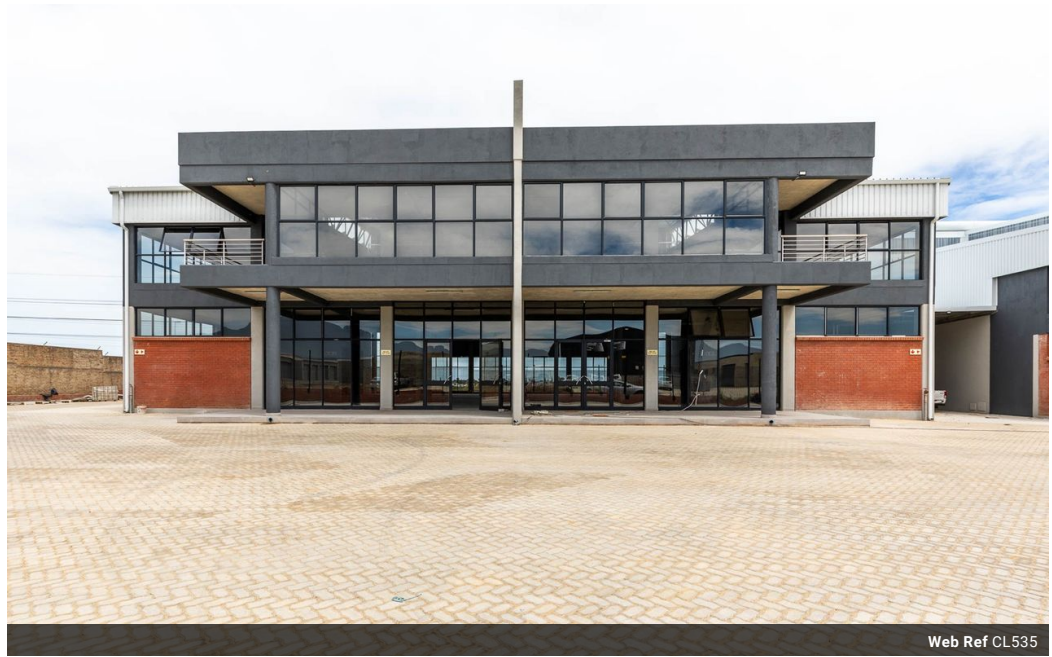
Web Ref CL535

Loft Office 6 The Woodmill Lifestyle Centre Vredenburg Road Devonvallei Stellenbosch 7600