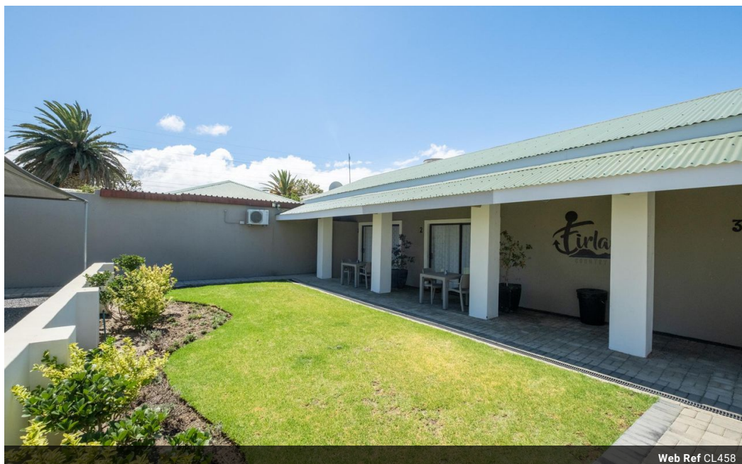
Web Ref CL458

Loft Office 6 The Woodmill Lifestyle Centre Vredenburg Road Devonvallei Stellenbosch 7600