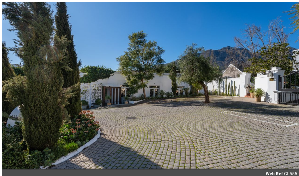
Web Ref CL555

Loft Office 6 The Woodmill Lifestyle Centre Vredenburg Road Devonvallei Stellenbosch 7600