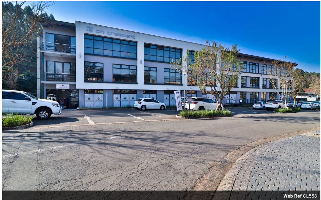
Web Ref CL558

Loft Office 6 The Woodmill Lifestyle Centre Vredenburg Road Devonvallei Stellenbosch 7600