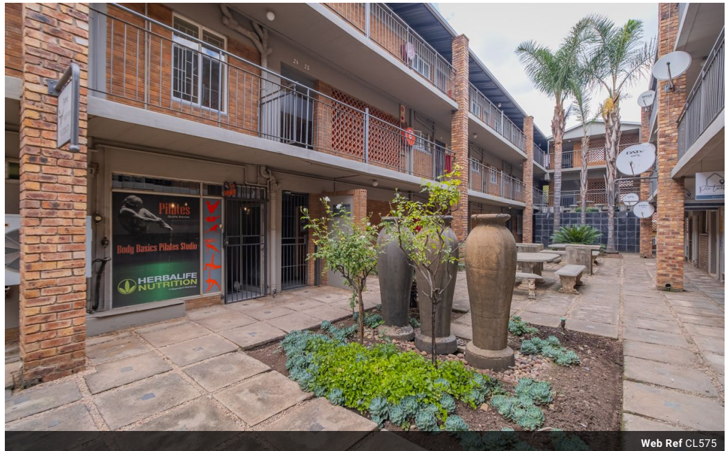
Web Ref CL575

Loft Office 6 The Woodmill Lifestyle Centre Vredenburg Road Devonvallei Stellenbosch 7600