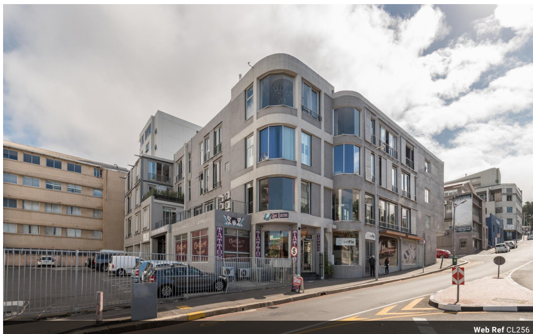
Web Ref CL256

Loft Office 6 The Woodmill Lifestyle Centre Vredenburg Road Devonvallei Stellenbosch 7600